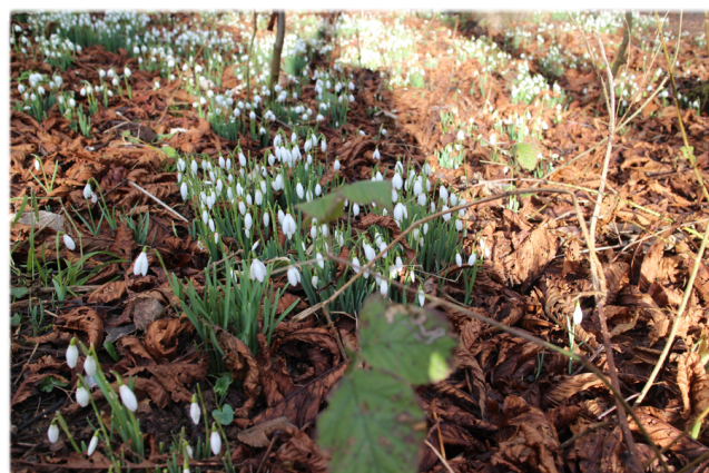
Esmé Gibson - FSU