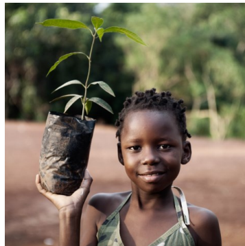
Planting fruit trees