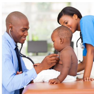
Sending medical aid