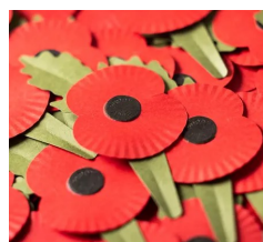
ROYAL LEGION POPPY APPEAL